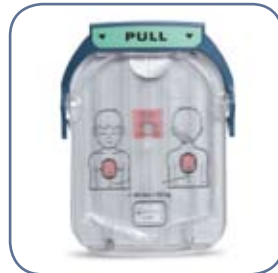
Infant/Child Pads to suit HeartStart First Aid (Pads and Infant/Child Keys also available for FRx and FR2+). M5072A