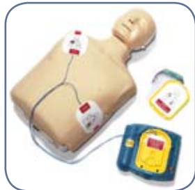
HeartStart First Aid Trainer with Little Anne Manikin - Trainers are available for all HeartStart Models (except MRx). M5086A

With our range of defibrillators we also have a selection of accessories available including defibrillator training carry cases, wall brackets and user DVD's. For more technical information on our defibrillators and details on our accessories please visit www.heartstart.com.au or www.heartstart.co.nz