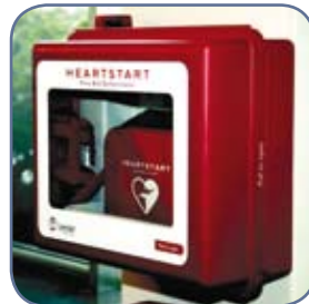
HeartStart Wall Box with Alarm. Battery operated alarm with sound and light when door is opened. 941343