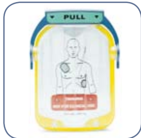
Adult Training Pads to suit HeartStart First Aid. M5073A