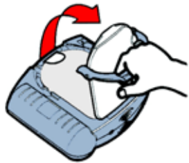
1-Turn ON, follow voice prompts