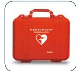
Pelican Case (Waterproof) to suit HeartStart First Aid and FRx. YC