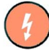
3-Press to Shock