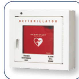
Basic AED Cabinet. Battery operated alarm with sound when door is opened. 9898 031 36531