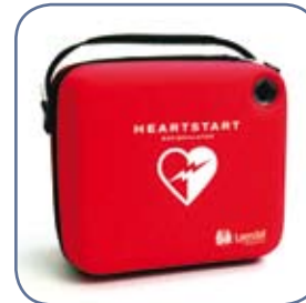
Standard Carry Case to suit HeartStart First Aid (All HeartStart First Aids sold come free with a Slimline version). 941340