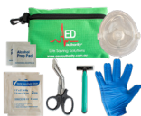
First responders kit