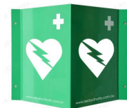
Order code: 3DAEDAR 3D projection wall sign