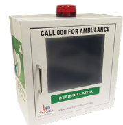
Order code: 147SM-1 Alarmed cabinet