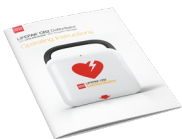
Operating instructions manual