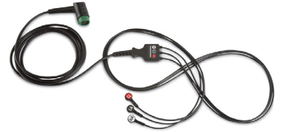
LIFEPAK ECG Lead