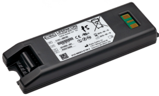
LIFEPAK CR2 Battery