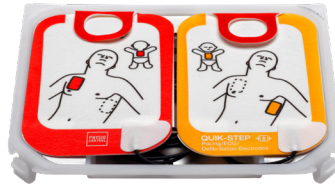
LIFEPAK CR2 Essential Pads