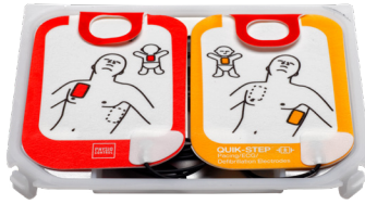
LIFEPAK CR2 Essential Pads